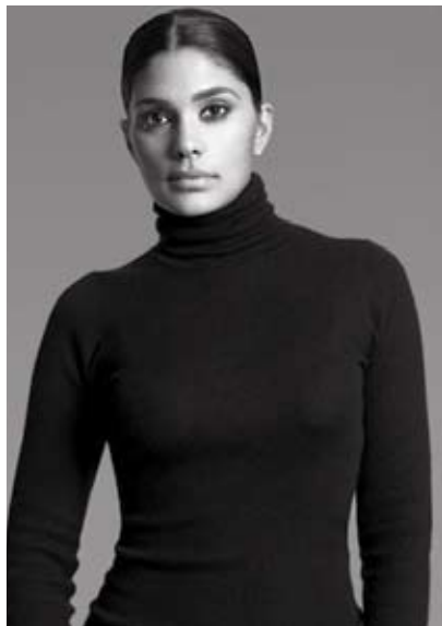
DESIGNER RACHEL ROY

Houston-based Amschwand Sarcoma Cancer Foundation (ASCF) raises both awareness and critical funds needed to meet the needs of thousands of persons diagnosed with sarcoma. By supporting some of the country's most promising young sarcoma researchers, including those at M.D. Anderson Cancer Center, M.D. Anderson Children's Cancer Center, Texas Children's Cancer Center, University of Texas Health Science Center San Antonio and many others, ASCF has succeeded in helping to develop both new therapies and delivery methods for adult and pediatric sarcoma patients. In addition, ASCF maintains three fully furnished corporate apartments in the Texas Medical Center, where they provide free short-term housing to patients who live outside our city limits but come to our area in the hope of receiving life-saving treatment. Finally, ASCF maintains its commitment to educating the public about sarcoma and the needs of those affected by it. This past year, the organization's Two by Two awareness campaign reached 23 states as well as the United Kingdom, raising a greater awareness of the needs of persons affected by sarcoma.