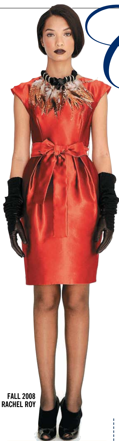
FALL 2008 RACHEL ROY