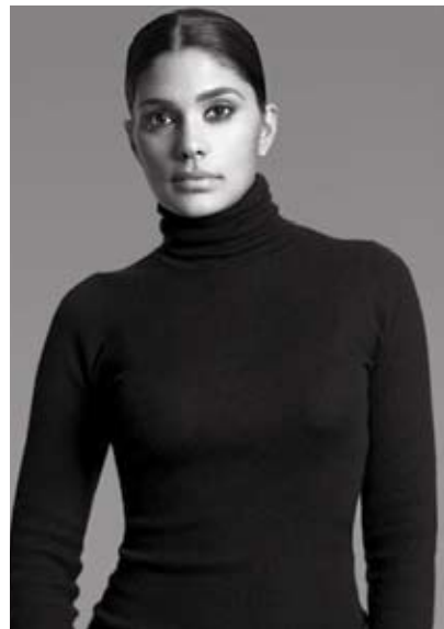
DESIGNER RACHEL ROY

Houston-based Amschwand Sarcoma Cancer Foundation (ASCF) raises both awareness and critical funds needed to meet the needs of thousands of persons diagnosed with sarcoma. By supporting some of the country's most promising young sarcoma researchers, including those at M.D. Anderson Cancer Center, M.D. Anderson Children's Cancer Center, Texas Children's Cancer Center, University of Texas Health Science Center San Antonio and many others, ASCF has succeeded in helping to develop both new therapies and delivery methods for adult and pediatric sarcoma patients. In addition, ASCF maintains three fully furnished corporate apartments in the Texas Medical Center, where they provide free short-term housing to patients who live outside our city limits but come to our area in the hope of receiving life-saving treatment. Finally, ASCF maintains its commitment to educating the public about sarcoma and the needs of those affected by it. This past year, the organization's Two by Two awareness campaign reached 23 states as well as the United Kingdom, raising a greater awareness of the needs of persons affected by sarcoma.